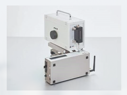
Aerosol spectrometer including dilution unit