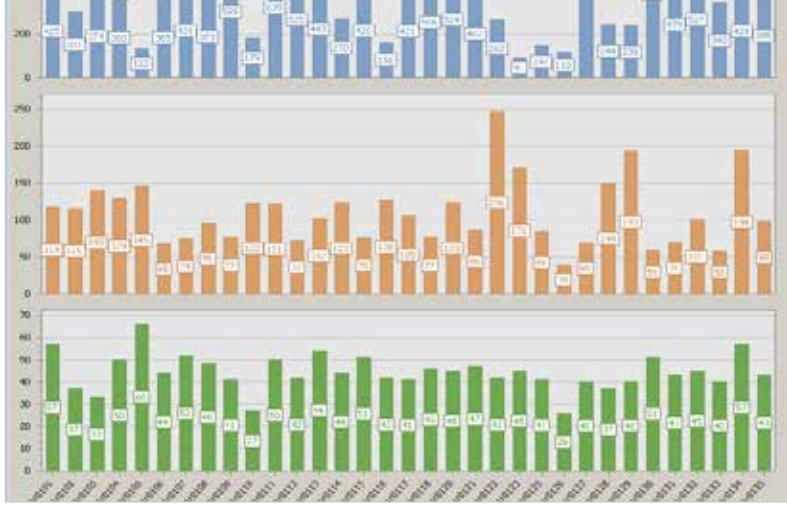
Analyzer - Charts (number of licks, nosepokes, visits)