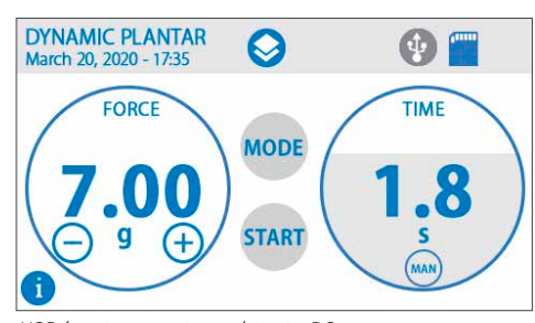
USB key to export csv data to PC