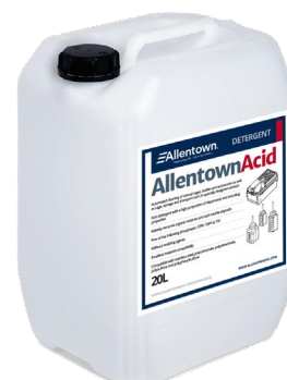
Available in 10 and 20 L