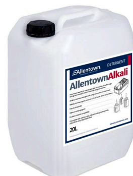
Available in 10 and 20 L